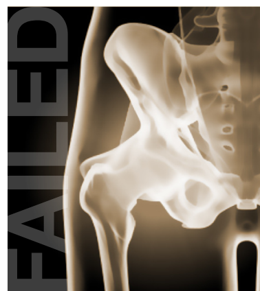
If you or a loved one has had a DePuy Orthopedics ASR Hip Resurfacing and ASR XL Acetabular System implanted, contact our office today.

These ASR hip systems have been implanted in approximately 93,000 patients worldwide since 2003. Of those, approximately 13% of patients have required revision surgery within five years. Patients in some cases have reported that the systems are not only causing pain, infection and mobility issues, but also generate metal debris in the patient's body. This metal debris can create toxic levels of materials such as chromium and cobalt in patients' surrounding bone, tissue and bloodstream.